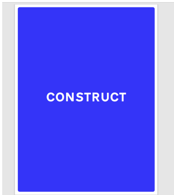
Samples of publication cover and internal page spreads