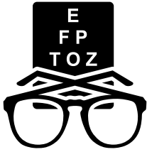
Vision Care 9:30

The Support Centre for any adult in Birmingham that faces homelessness