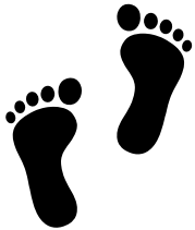
Chiropodist (Last Thursday of the month) 9:30 to 13:00