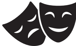
Geese Theatre 13:30