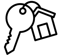
HTWS and EANS Drop-In 13:30 to 16:00