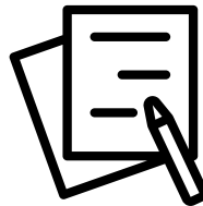
Employability Coach Tuesday, Wednesday and Friday mornings