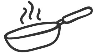
Cooking Class (Spaces limited) 13:30-16:00