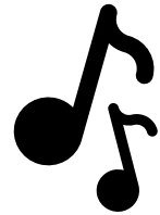
Music Therapy Activity Room 12:00 - 15:30