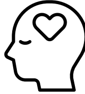
Mental Health Team Monday and Thursday mornings