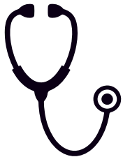
Nurse 9:00 - 13:00